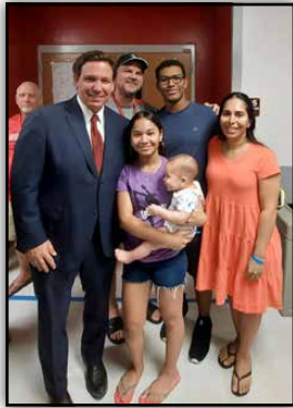
SFMHS Welcomes Governor Ron DeSantis to visit our school which was a Hurricane Shelter