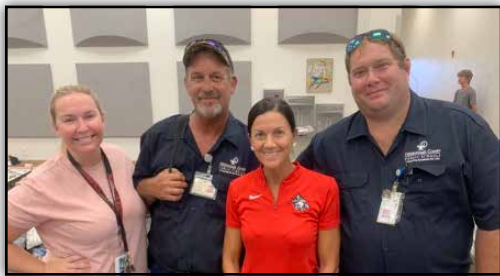
Hillsboro School District offers a helping hand to Lee County Schools