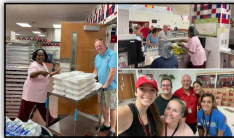
Café Mgr. preparing a meal for the evacuees